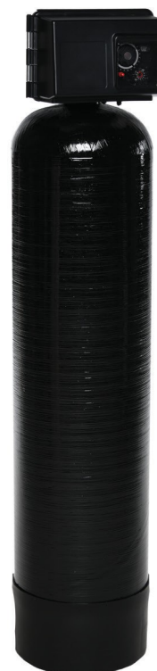
13x54 black tank Fleck 2750