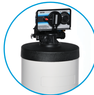
10x54 platinum jacket Fleck 5600