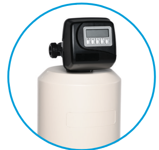
10x54 almond jacket Clack WS1