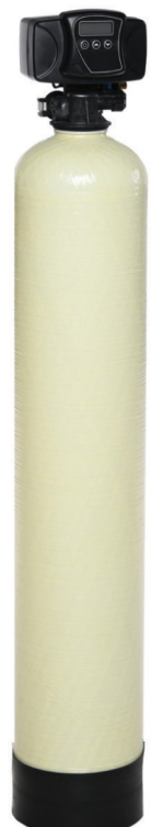
9x48 almond tank Fleck 5600 sxt